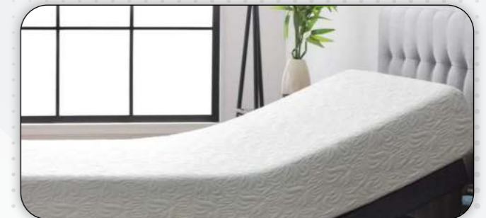
Zero Wall Clearance