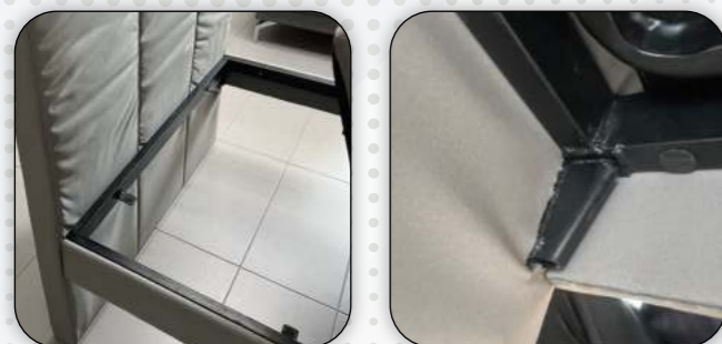
Knockdown Joint Design