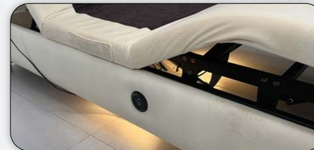
Under-Bed LED Lighting